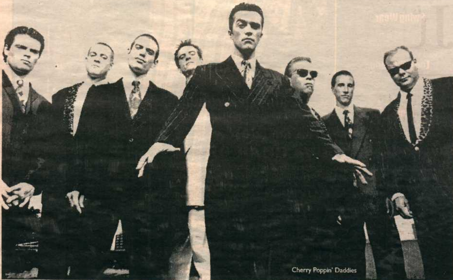
Cherry Poppin' Daddies

Look for the Daddies' newest single, "So Long Toots," in Newline Cinema's latest film Blast From The Past and on the movie soundtrack.