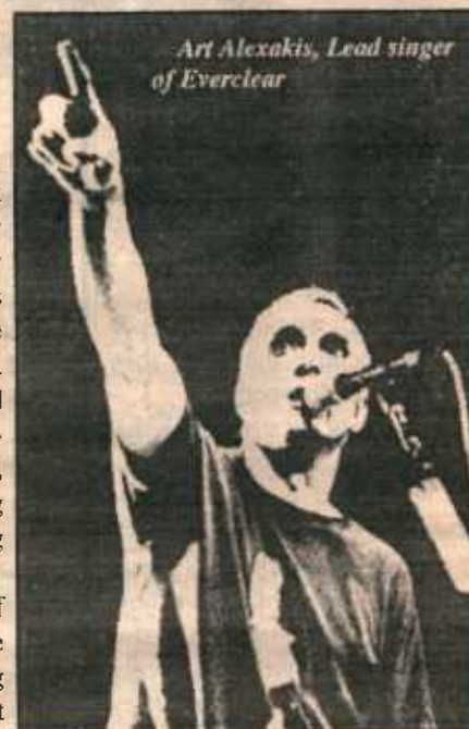
Art Alexakis, Lead singer of Everclear

To say that the pre-pubescent crowd had little interest in the first two bands to hit the stage would